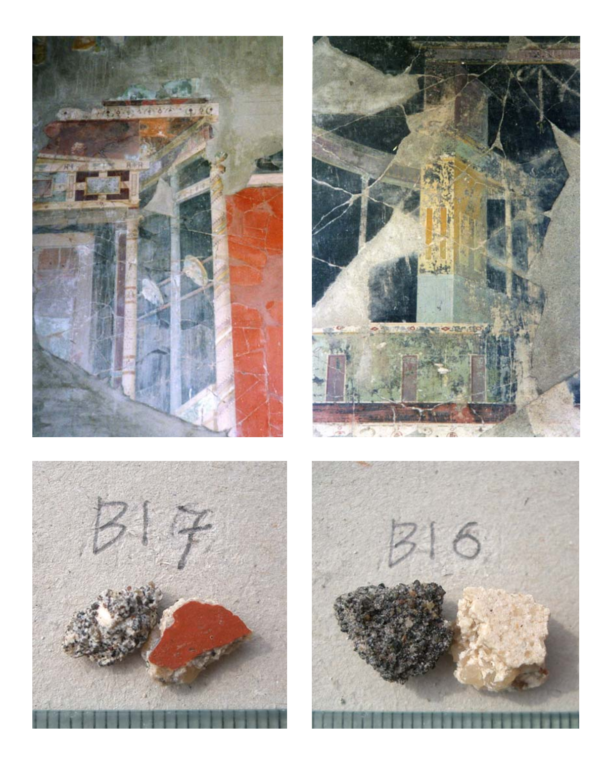
Fig. 12. Above: To the left. Decoration in the tablinum , detail. To the right: triclinium decoration, detail. Below: To the left. Plaster type BI7, taken from the tablinum decoration. To the right. Plaster type BI6, taken from the triclinium decoration.