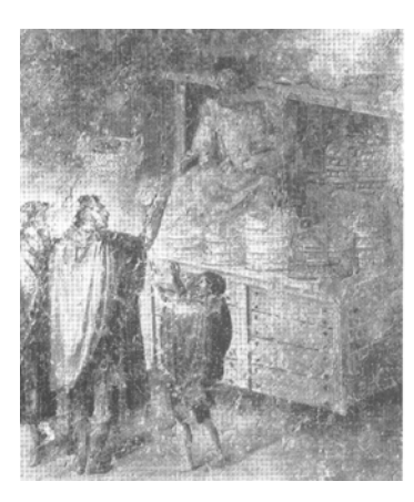
3. Bread Shop. Wall painting form h VII.3.30, Pompeii